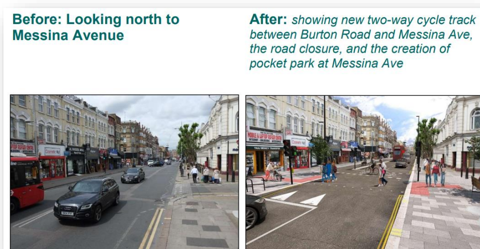
Figure 2: Section of Kilburn High Road: before and after images