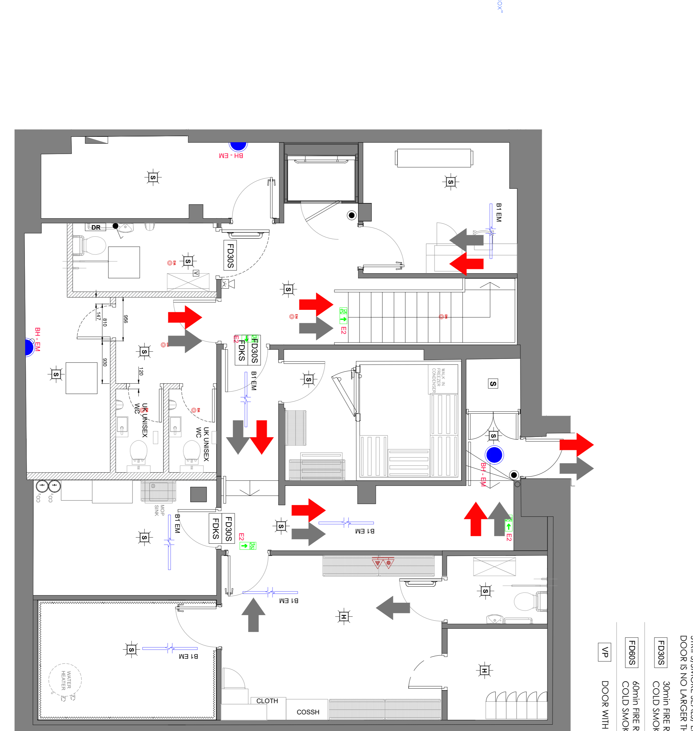
PROPOSED BASEMENT PLAN - SCALE 1:50