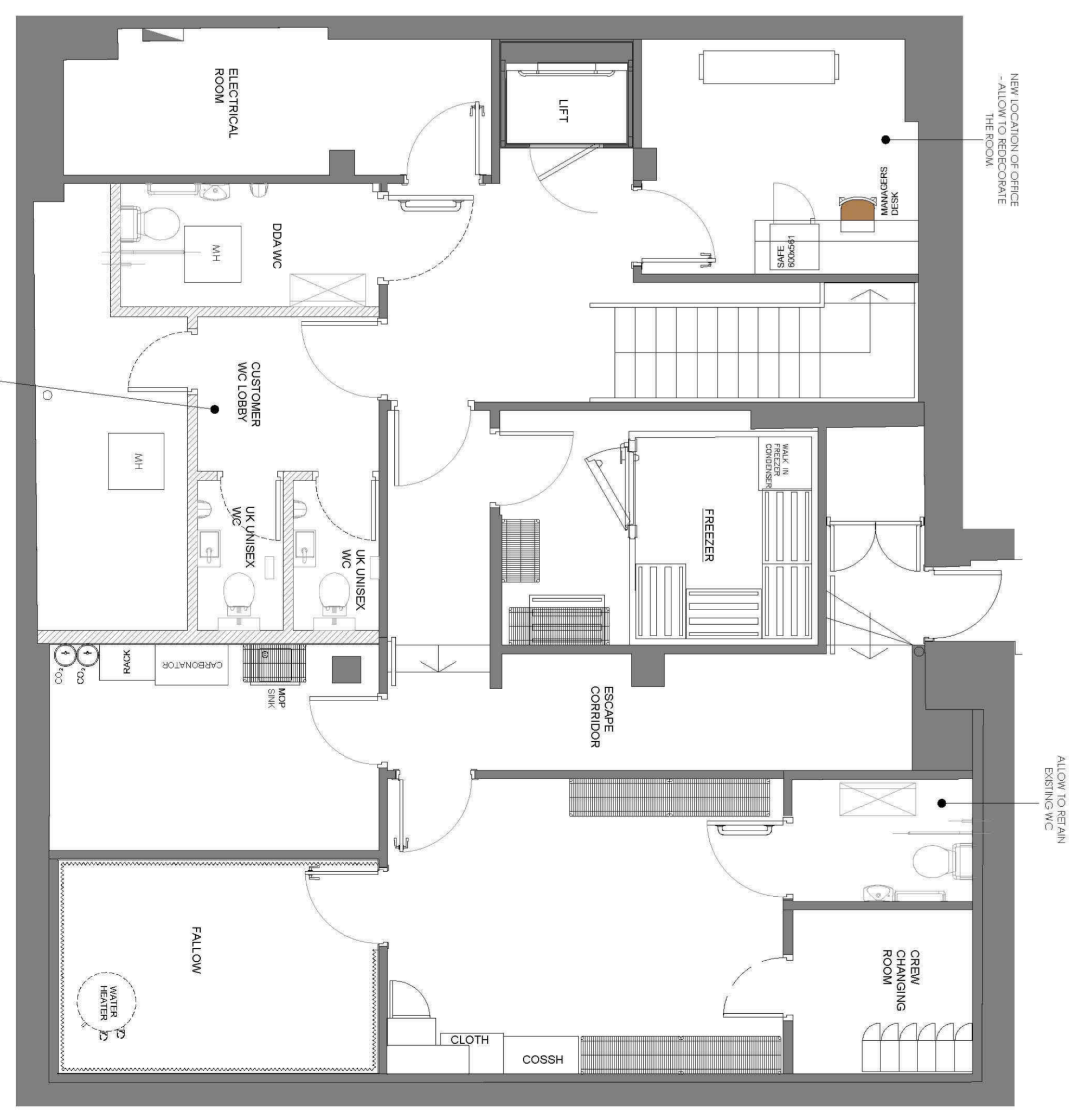
PROPOSED BASEMENT FLOOR PLAN - SCALE 1:50