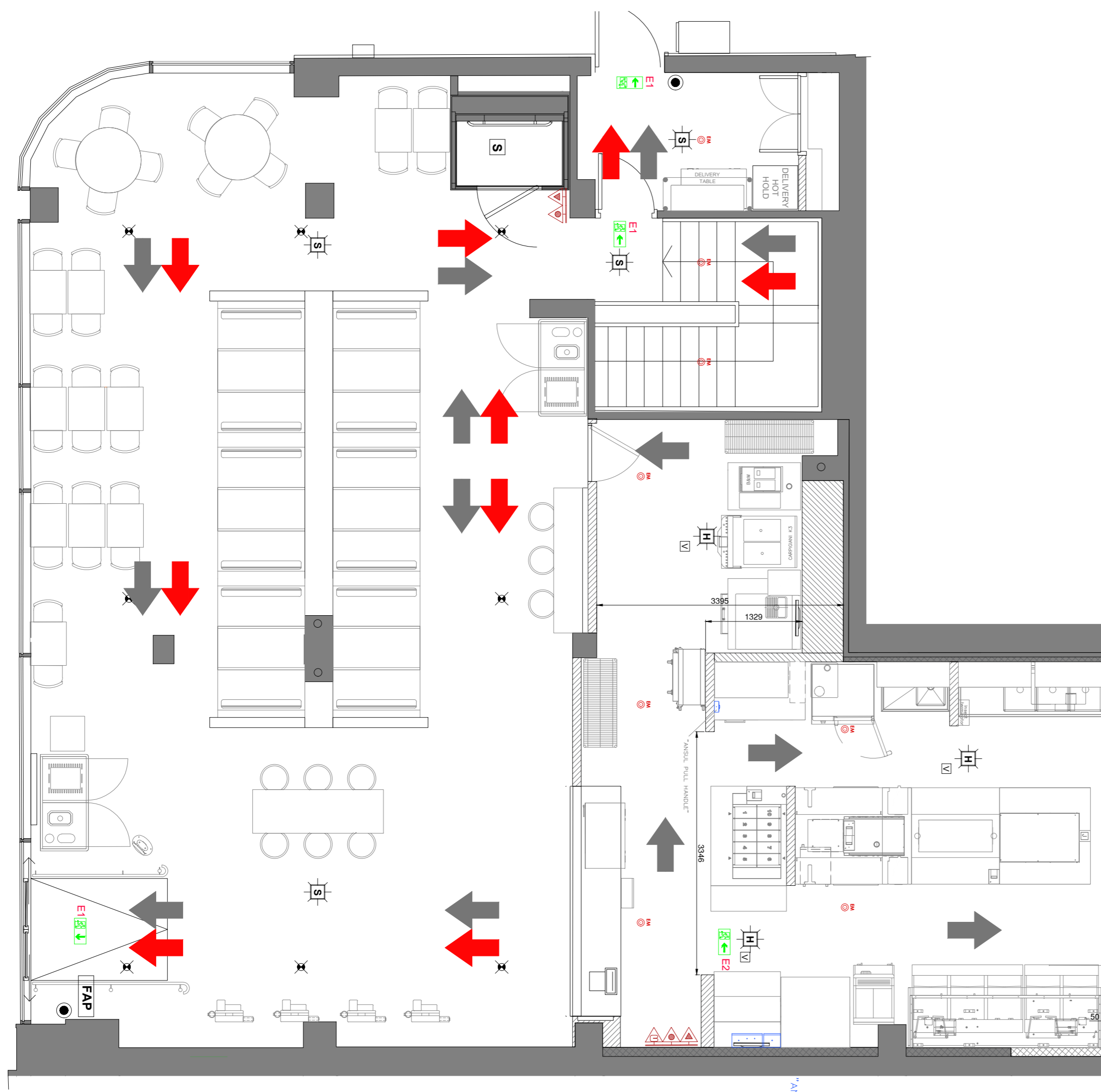
PROPOSED GROUND FLOOR PLAN - SCALE 1:50