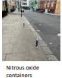
Nitrous oxide containers