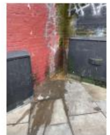
Buck Street is a urinal all day – even with public toilets available in the adjacent market