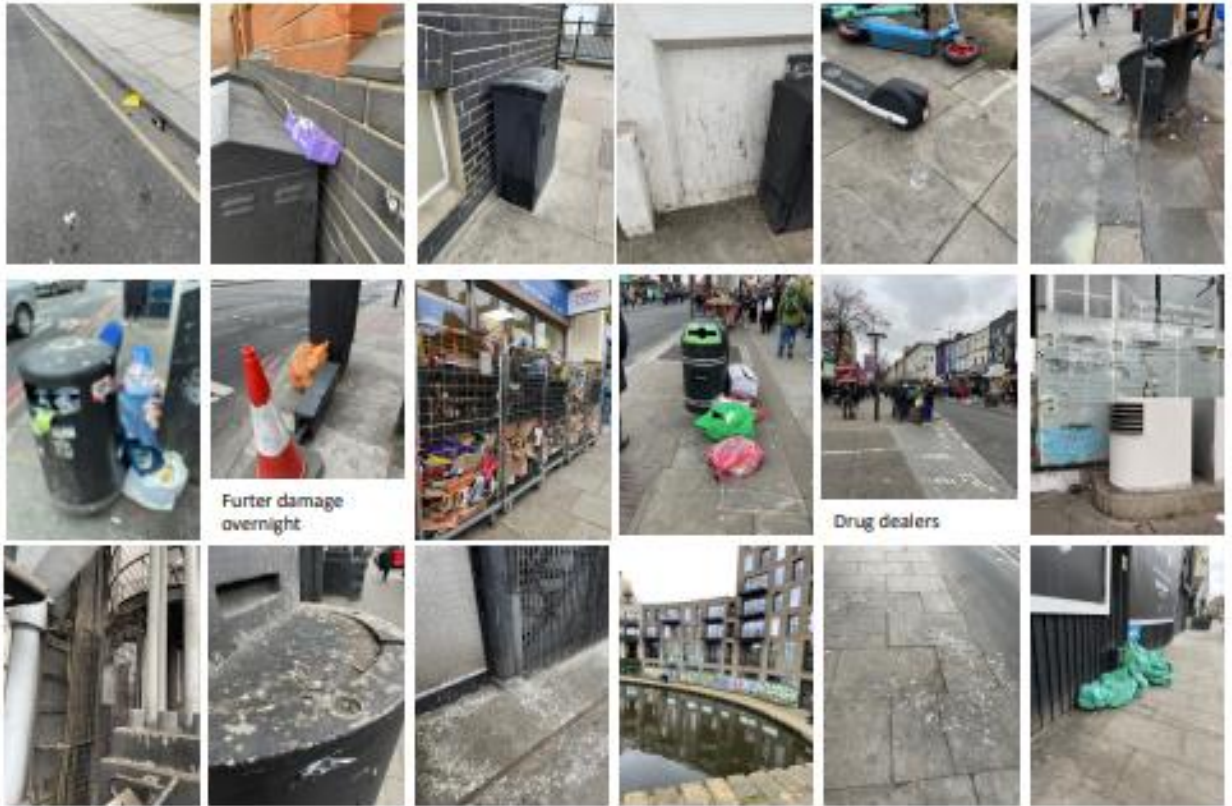
Further damage overnight

Examples of typical street conditions on a Sunday morning.