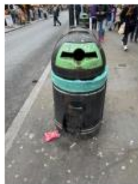
Empty bottles, graffiti, urine, dirt, drinks spillage – nothing cleaned.