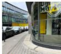
Plinth used to have planters but vandalised

Examples of typical street conditions on a Saturday afternoon.