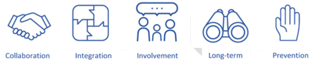
Figure 1: The 5 ways of working from the Well-being of Future Generations Act

Just as when we were preparing the Well-being Assessment, we have used the five ways of working, collaboration, integration, involvement, long-term, and prevention, to guide our work. This means that while considering how to improve well-being in our communities now, we've also looked at how well-being could be affected in the future and how we can prevent issues becoming worse. We will need to work together to see what we're each doing in a community and how this affects what we do, individually and in partnership. Finally, but most importantly, we want our communities, professionals, businesses, and others to identify the issues which are most important to them. As we develop how we will be delivering the Objectives and Steps (regional and local delivery plans) we will continue to use these principles to guide our work.